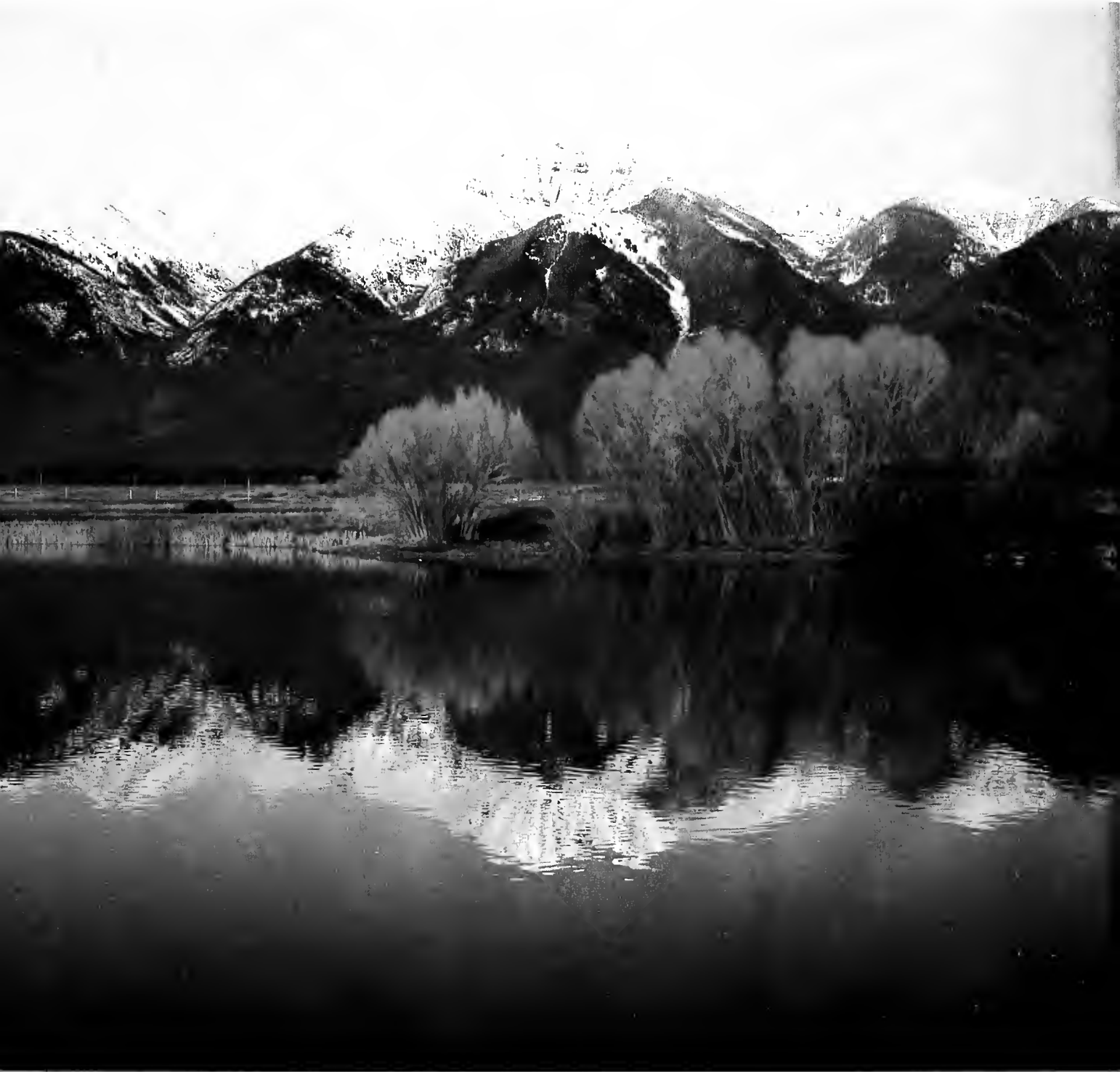
Mission Mountains: Kent Krone